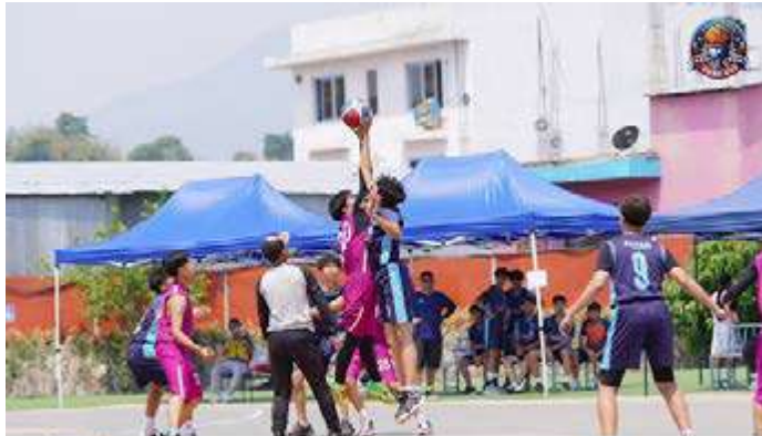
Organized By: EURO SCHOOL Euro School, New Colony, Ganesh Chowk, Hattigaunda, Kathmandu, Nepal Ph : 01-4372494, 01-4372739, 01-4372670 www.euroschool.edu.np

The senior girls' and boys' basketball teams participated in the week-long tournament organised by Euro School, starting on May 30th. Although the teams did not make it to the finals, they were not easy to beat and played hard. Participating in such tournaments is an opportunity for our learners to celebrate their love for basketball, and in the past, we have come back home with the winning trophy.