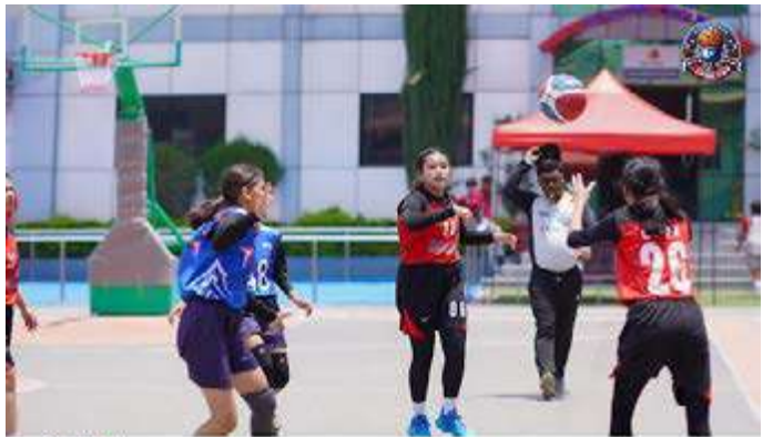
Organized By: EURO SCHOOL Euro School, New Colony, Ganesh Chowk, Hattigaunda, Kathmandu, Nepal Ph : 01-4372494, 01-4372739, 01-4372670 www.euroschool.edu.np