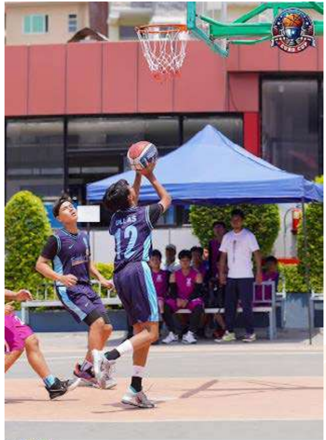
Organized By: EURO SCHOOL Euro School, New Colony, Ganesh Chowk, Hattigaunda, Kathmandu, Nepal Ph : 01-4372494, 01-4372739, 01-4372670 www.euroschool.edu.np