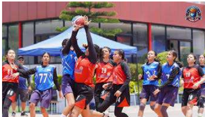
Organized By: EURO SCHOOL Euro School, New Colony, Ganesh Chowk, Hattigaunda, Kathmandu, Nepal Ph : 01-4372494, 01-4372739, 01-4372670 www.euroschool.edu.np