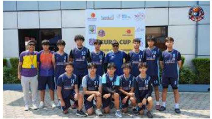
Organized By: EURO SCHOOL Euro School, New Colony, Ganesh Chowk, Hattigaunda, Kathmandu, Nepal Ph : 01-4372494, 01-4372739, 01-4372670 www.euroschool.edu.np